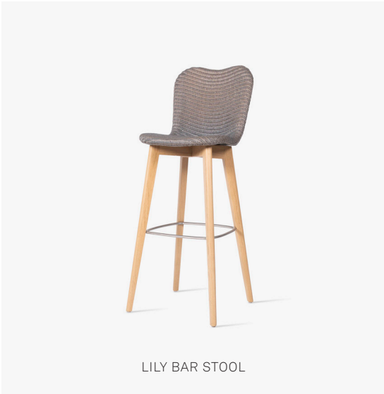
LILY BAR STOOL