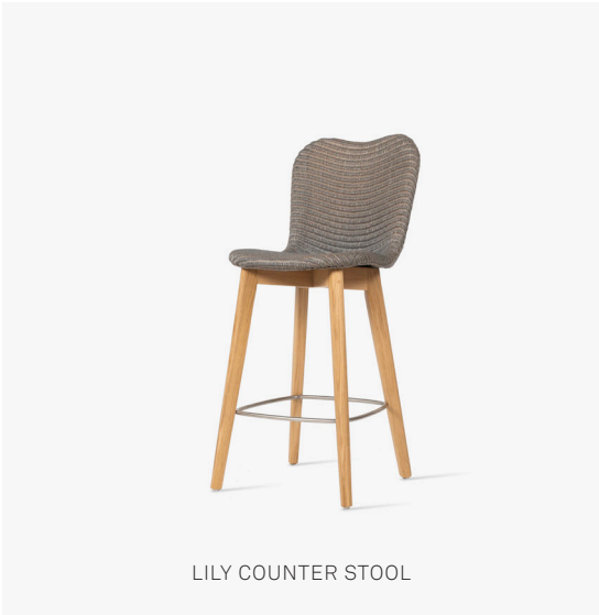
LILY COUNTER STOOL