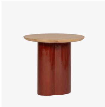
ARVIN SIDE TABLE