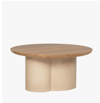
ARVIN COFFEE TABLE