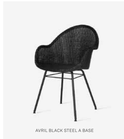
AVRIL BLACK STEEL A BASE