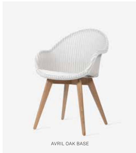
AVRIL OAK BASE