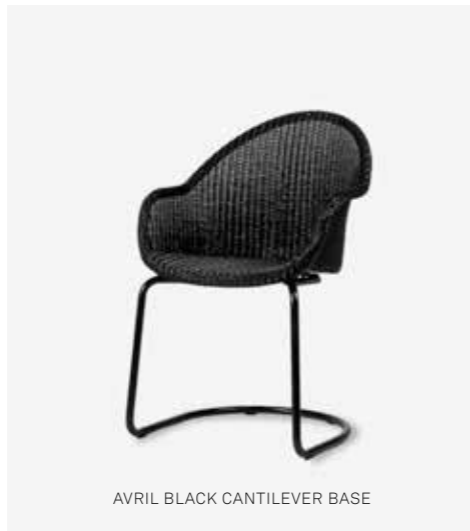
AVRIL BLACK CANTILEVER BASE