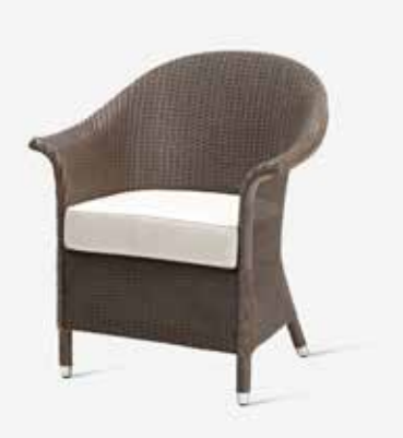
VICTOR XL LAZY CHAIR