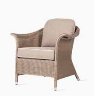
VICTOR LOUNGE CHAIR