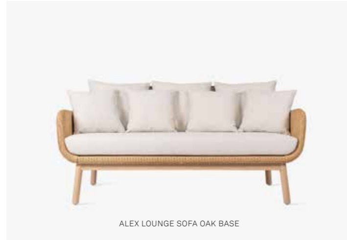
ALEX LOUNGE SOFA OAK BASE