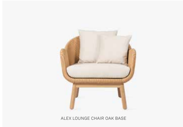
ALEX LOUNGE CHAIR OAK BASE