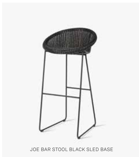
JOE BAR STOOL BLACK SLED BASE