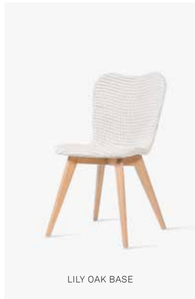
LILY OAK BASE