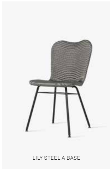
LILY STEEL A BASE