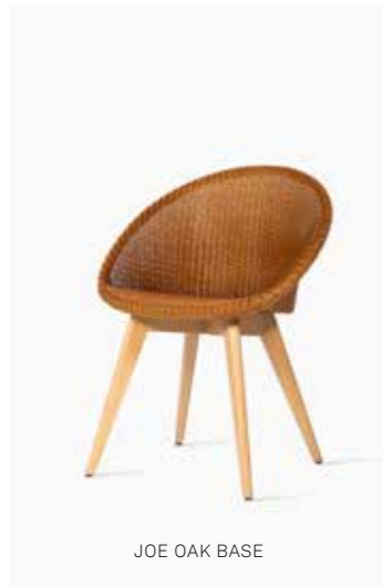
JOE OAK BASE