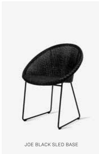
JOE BLACK SLED BASE