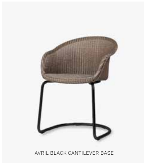
AVRIL BLACK CANTILEVER BASE