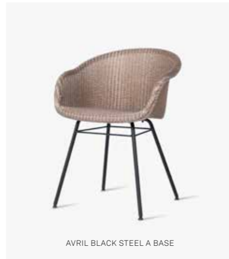
AVRIL BLACK STEEL A BASE