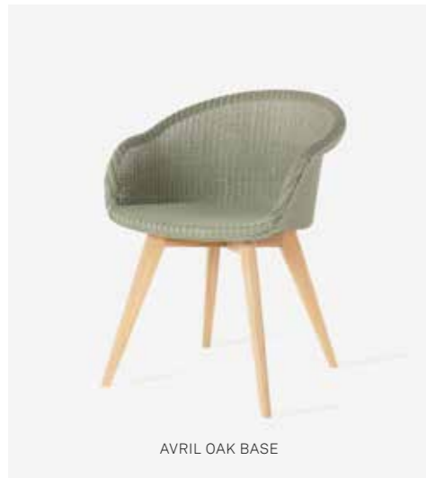
AVRIL OAK BASE