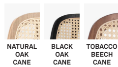
NATURAL OAK CANE