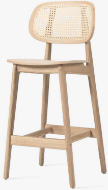
TITUS NATURAL OAK COUNTER STOOL