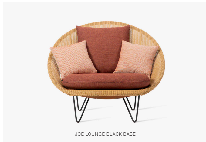
JOE LOUNGE BLACK BASE