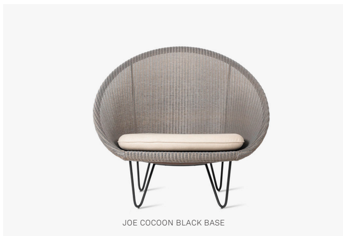
JOE COCOON BLACK BASE