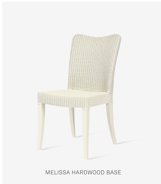
MELISSA HARDWOOD BASE