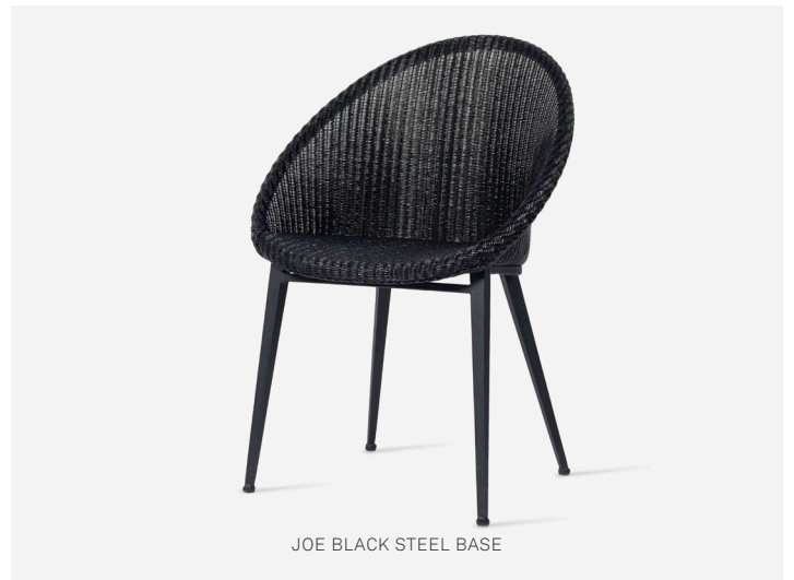
JOE BLACK STEEL BASE