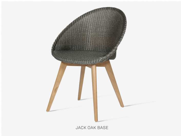
JACK OAK BASE